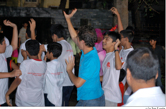
Kay aims to improve the lot of poor Indians through market-based solutions.

EK: To mitigate indoor air pollution - the second largest killer globally of children under the age of five - we partnered with BP to design and distribute a biomass pelletpowered cooking stove. To tackle EK: The projects are extremely fulfatal sanitation-related diseases, such as typhoid, cholera, meningitis, and diarrhoea, we launched a community-based toilet construction enterprise. Both of these initiatives hire village women to serve as distribution agents.