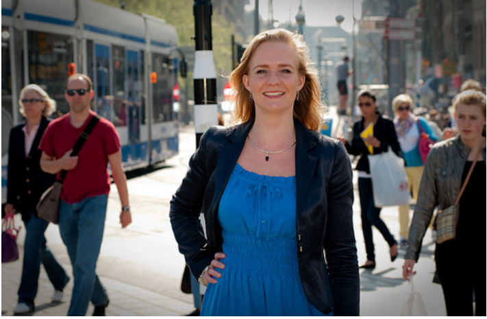
Marietje Schaake, 30, is an HIA Senior Fellow as well as a Netherlands MEP.

Europe took to the polls in early June to elect over 700 Members of across European Union member states. Two big headlines emerged from the results. 1) The British Labour Party got absolutely trounced and 2) the right wing, anti-European party of Dutch Politician Geert brightest and most promising Wilders made big inroads.